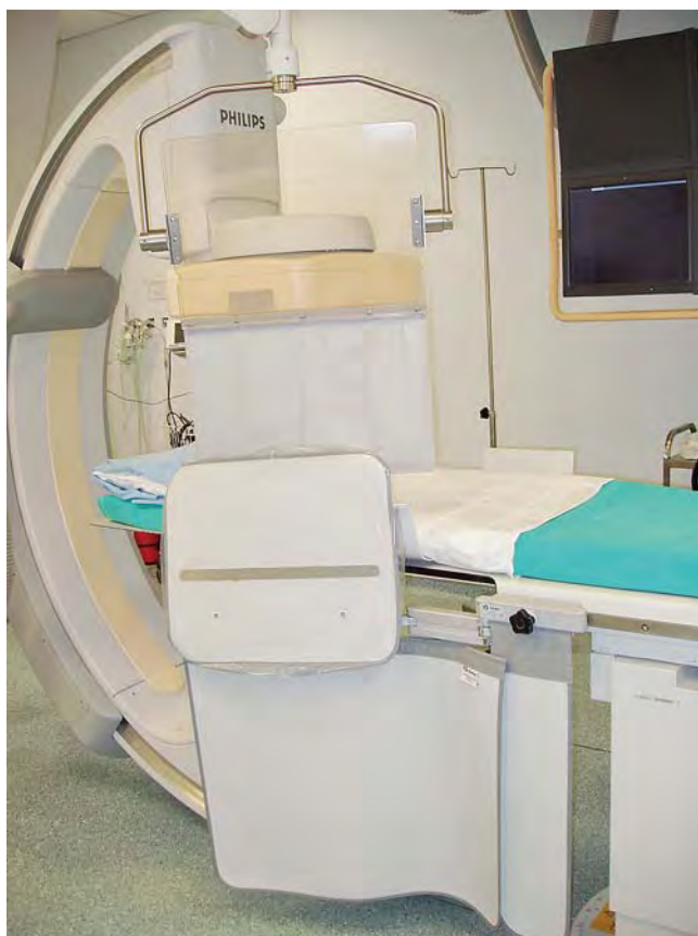
Fig. 3 Under-couch X-ray system with protective radiation shields placed under and over the table, to protect the endoscopist from radiation that originates from the X-ray tube and from the patient (scattered radiation), respectively.

about warnings that are activated when X-rays are being delivered vary considerably between EU countries (e.g., warning lights outside of the room are legally required in Greece). Doors leading into the X-ray room must have signs that indicate the presence of the X-ray unit. Notices that ask patients to inform about possible pregnancy should be posted at the reception area [69].