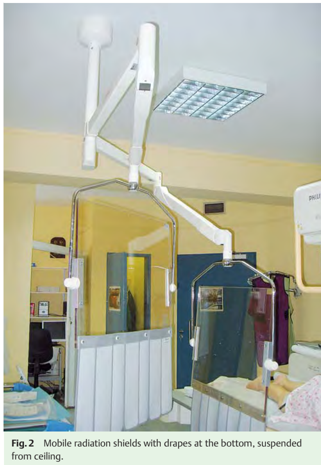
Fig. 2 Mobile radiation shields with drapes at the bottom, suspended from ceiling.

There are no trials available regarding this issue but radiation-warning lights inside and outside the examination room are recommended; they must operate automatically [68]. Regulations